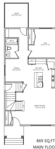
869 SQ.FT. MAIN FLOOR